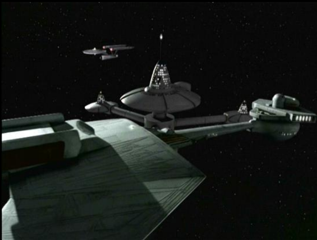
U.S.S. Enterprise and I.K.S. Gr'oth at Deep Space Station K-7