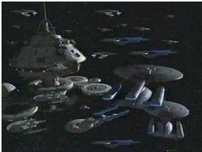
U.S.S. Bonaventure arrives at Starbase 39 Sierra with elements from the 22nd, and 5th Fleets. The Bonaventure participated in the Battle of the Three Suns and served as the personal flagship of Admiral David Bowman for the duration of the Dominion War.

The refit is still capable of separating the saucer from the stardrive, but unlike the conventional Galaxy-class , this is intended as an emergency life boat, and is not capable of extensive maneuvers or extended endurance.