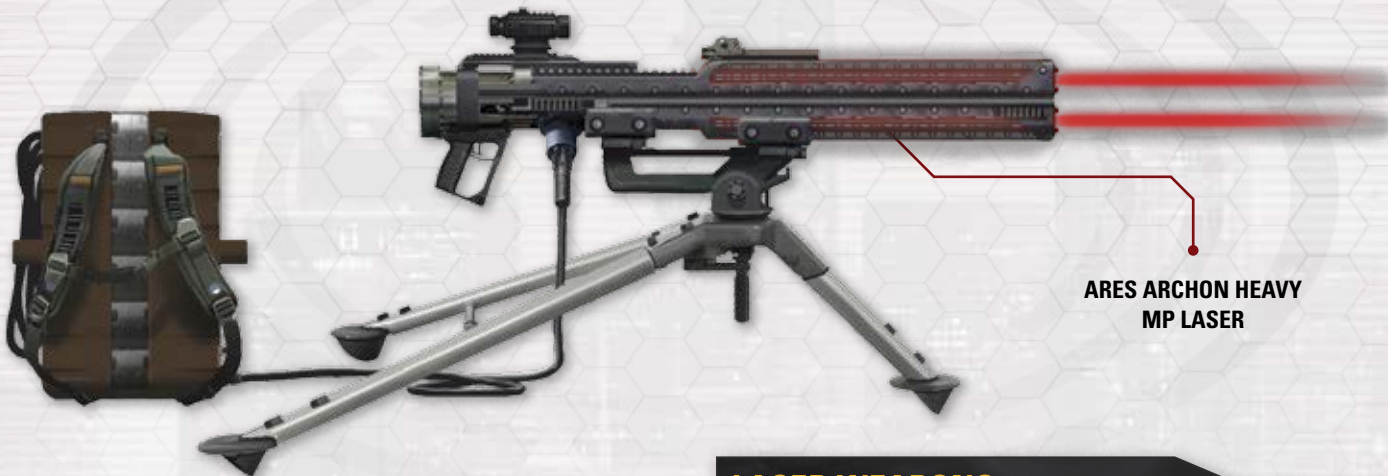
ARES ARCHON HEAVY MP LASER