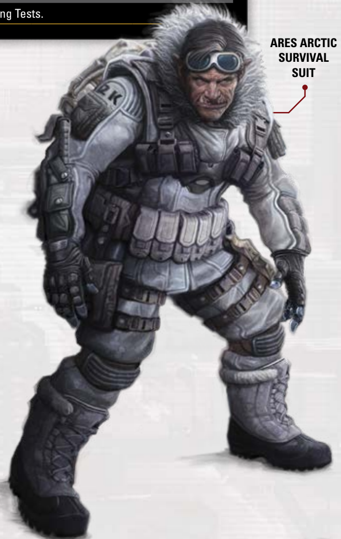
ARES ARCTIC SURVIVAL SUIT