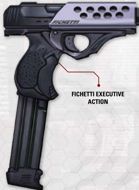
FICHETTI EXECUTIVE ACTION

“Manage your danger with Executive Action!” is the latest in a long series of taglines for this pistol, which incorporates a burst-fire option as standard. With no other truly compelling features, marketing is what this firearm mostly has going for it, but that appears to be all it needs to keep selling well.