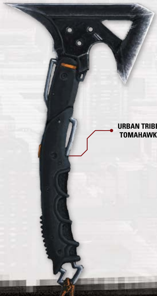
URBAN TRIBE TOMAHAWK

This is not your grandfather's tomahawk. Made from modern composites and balanced for throwing, this modern take on the classic Native American weapon gives as much respect to its predecessors as it can while moving into the 21st century. Popular among the urban tribal street gangs, especially the First Nations in Seattle, these finely crafted killing tools can also be found on the belts of Salish Rangers and Sioux Wildcats.