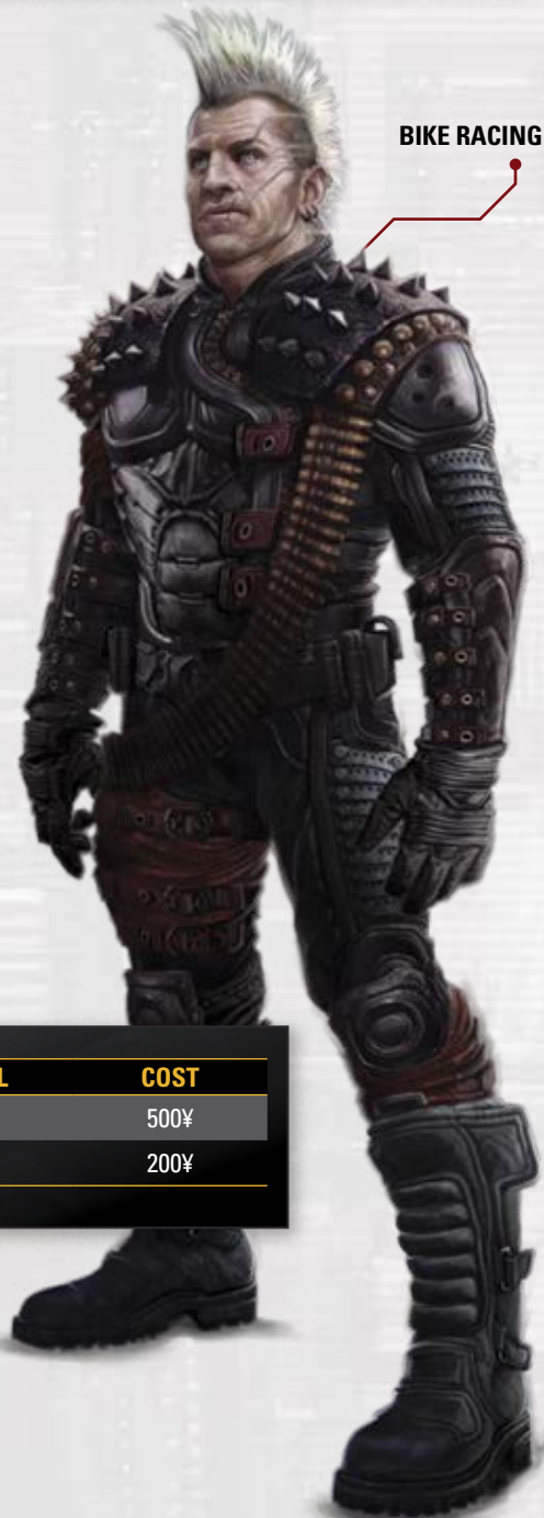
BIKE RACING ARMOR