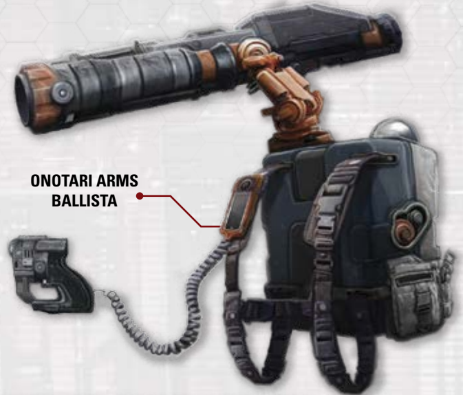
ONOTARI ARMS BALLISTA