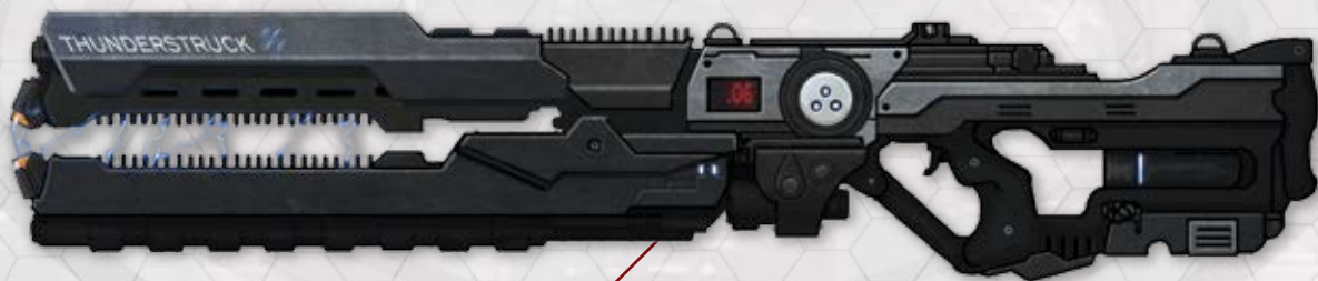
ARES THUNDERSTRUCK GAUSS RIFLE

The Thunderstruck uses both ammunition and energy for each round fired. Power is supplied by peak-discharge battery packs and consumes 1 power unit per shot. The Thunderstruck can hold one power clip or draw its energy from an external source such as a satchel power pack, power backpack, or vehicle power if mounted.