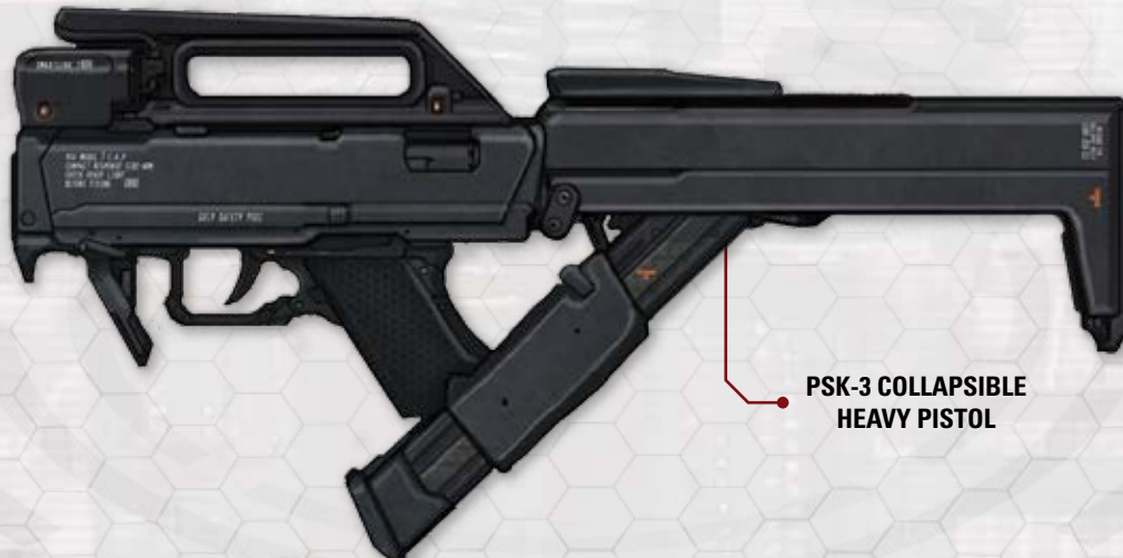
PSK-3 COLLAPSIBLE HEAVY PISTOL