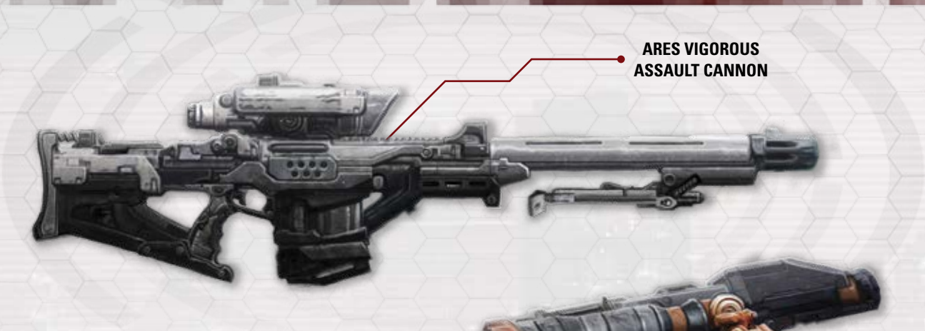
ARES VIGOROUS ASSAULT CANNON