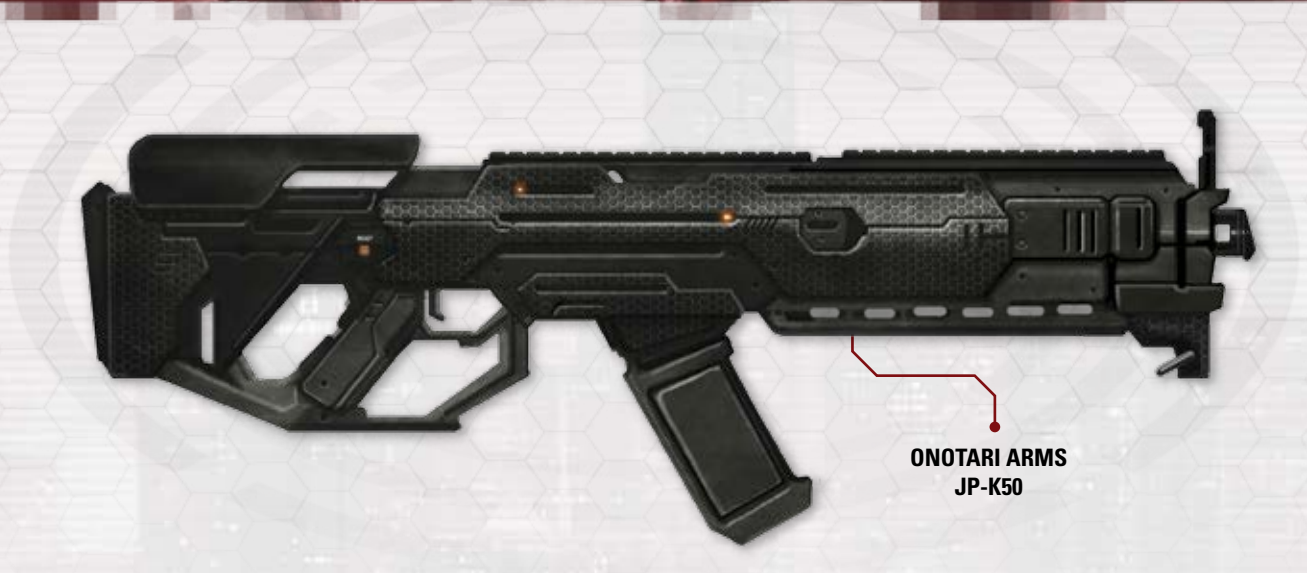
ONOTARI ARMS JP-K50