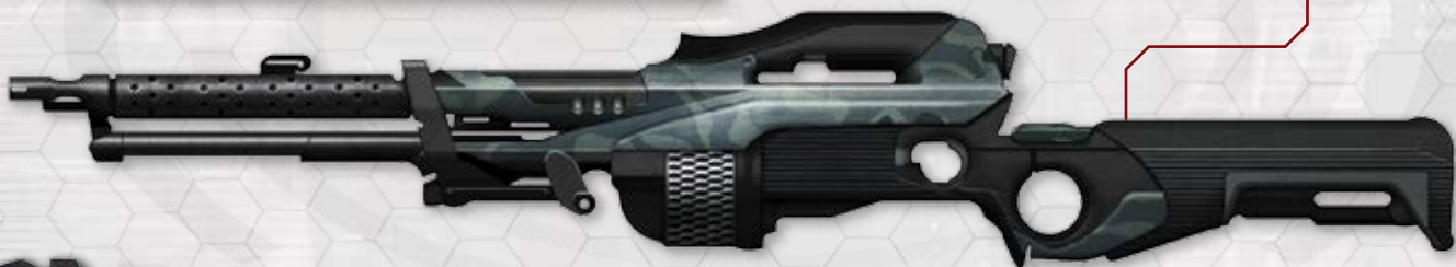
TERRACOTTA ARMS AM-47

Standard upgrades: Bipod, commlink (Device Rating 5), imaging scope (low-light vision, image link, vision magnification), smartgun