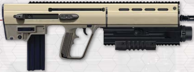
NISSAN OPTIMUM II