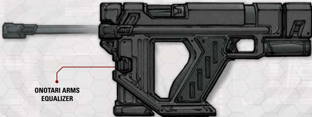
ONOTARI ARMS EQUALIZER

Standard upgrades: Folding stock, laser sight