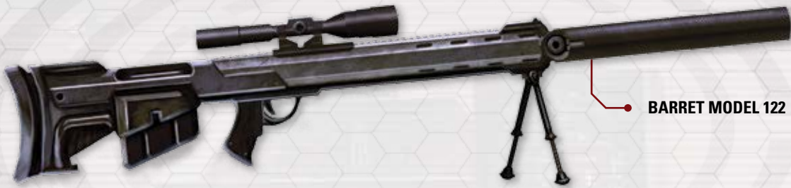
BARRET MODEL 122