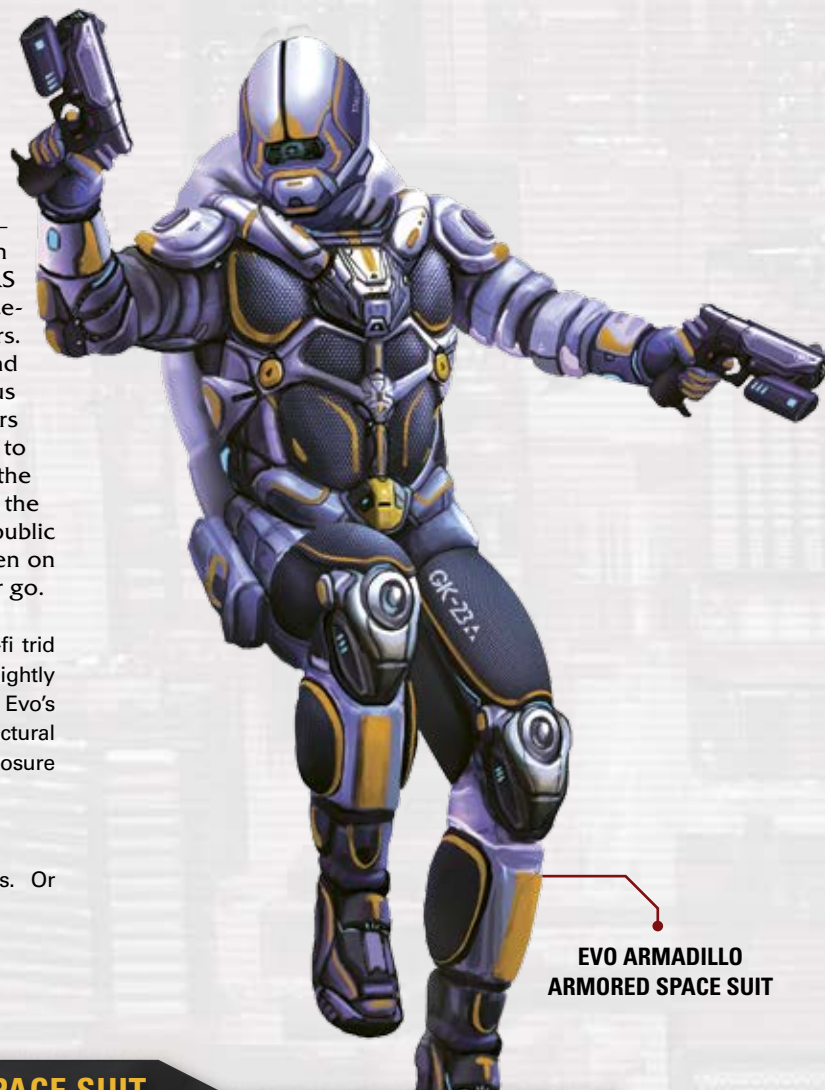
EVO ARMADILLO ARMORED SPACE SUIT