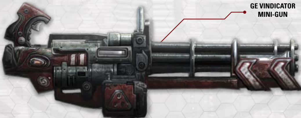
• GE VINDICATOR MINI-GUN

Users must take a Simple Action to rotate the barrels of the Vindicator before it can fire.