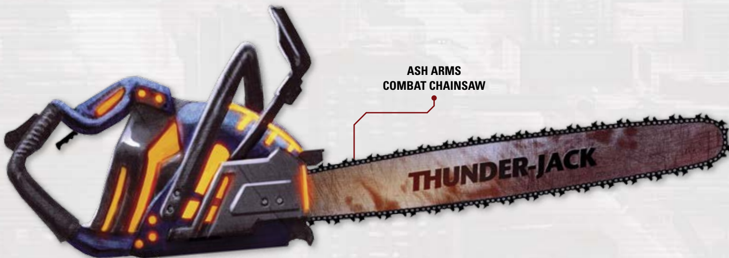
ASH ARMS COMBAT CHAINSAW

Non-combat versions of the chainsaw and monofilament chainsaw have their Accuracy reduced to 3, Damage Value reduced by 2, Availability changed to 2 and 6R respectively, and prices reduced to 150¥ and 1,500¥.