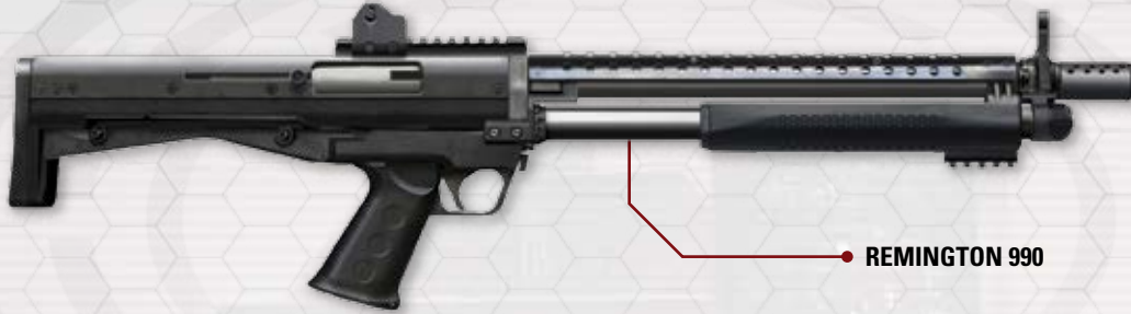
• REMINGTON 990