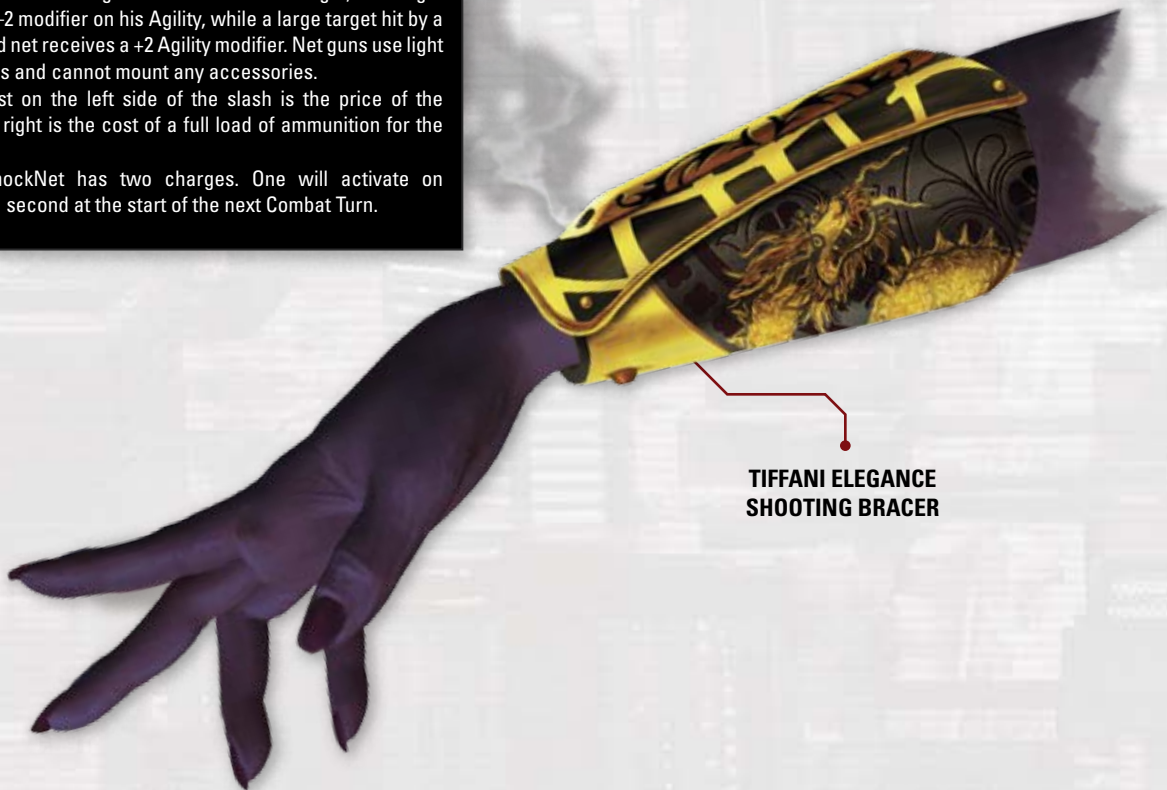
TIFFANI ÉLÉGANCE SHOOTING BRACER

The Élégance Shooting Bracer can only use caseless ammunition and uses taser ranges. It cannot mount any accessories. The bracer's Concealability modifier to hide its true function is -5 (see p. 419, SR5 ).