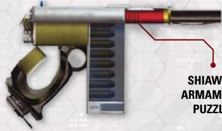
SHIAWASE ARMAMENTS PUZZLER