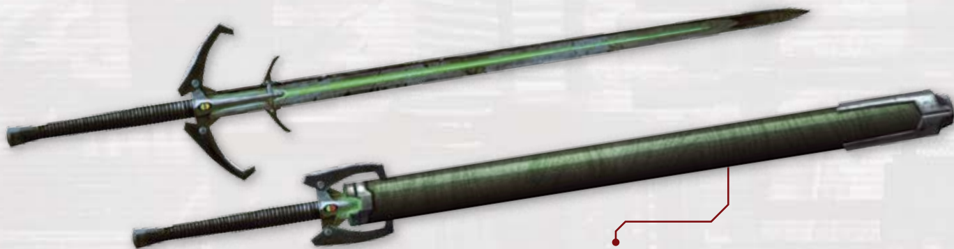
HIGHLAND FORGE CLAYMORE