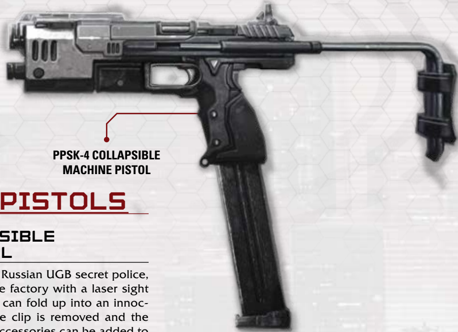
PPSK-4 COLLAPSIBLE MACHINE PISTOL