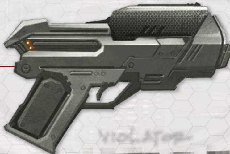
ONOTARI ARMS VIOLATOR

Standard upgrades: Advanced safety system, internal smartgun, safe target system base