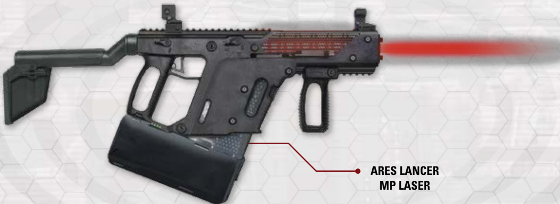
ARES LANCER MP LASER

The Archon uses 2 power units per shot and is either powered by twin power clips or by an external satchel or backpack power pack. It uses Assault Rifle ranges.