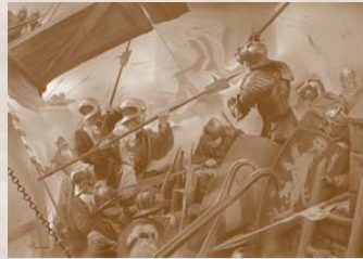
The Siege of Høneydar