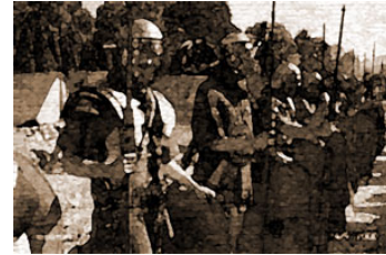
7th legion from Arx Metosud arriving at Hæneydar.