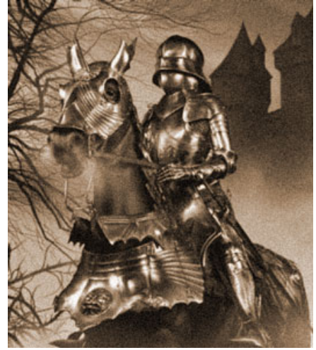
Lord Vannis Bourne, Marquess Ormaal Firstborn son of the Duke of Esor Mur Liberator of Kooneydar