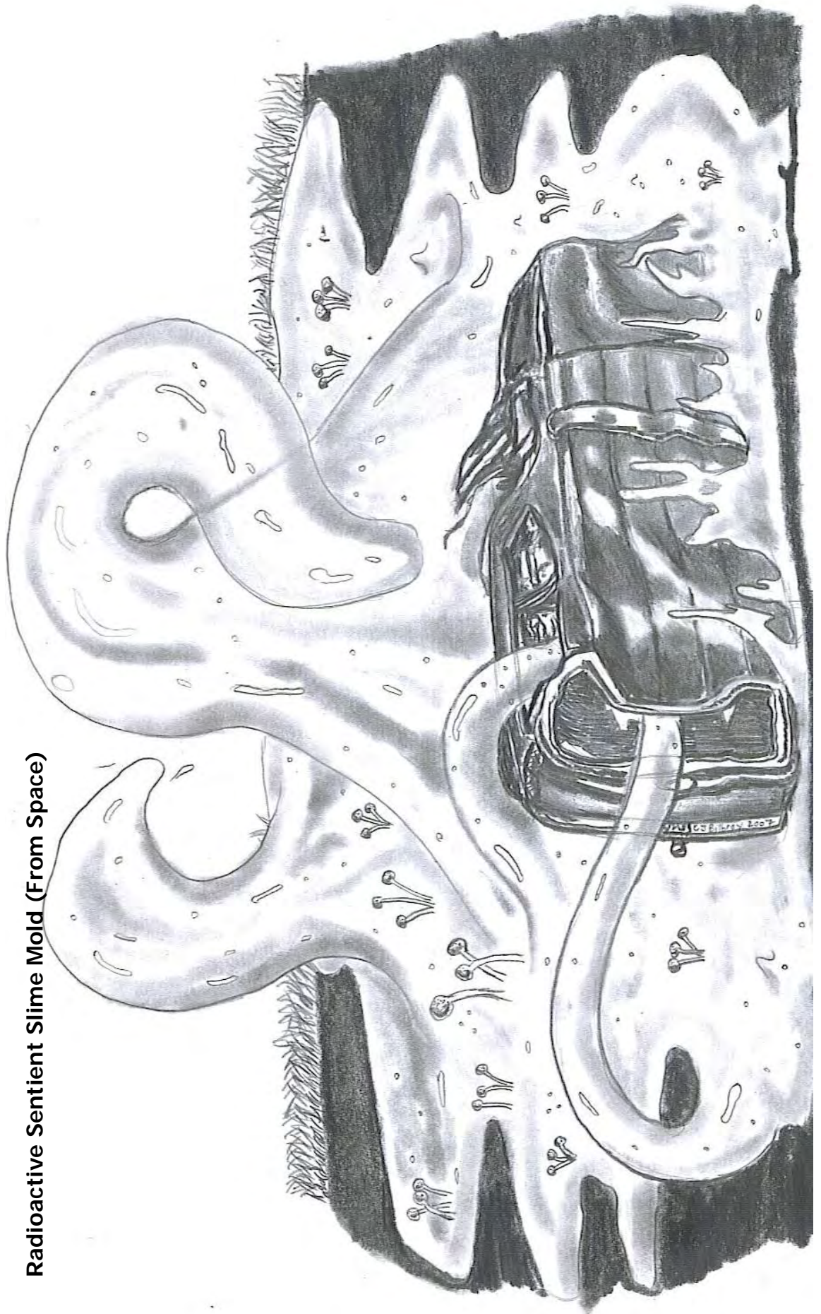
Radioactive Sentient Slime Mold (From Space)