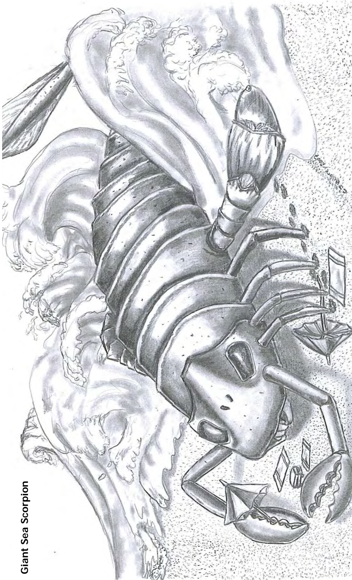
Giant Sea Scorpion