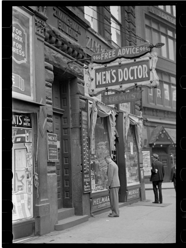
The Men's Doctor