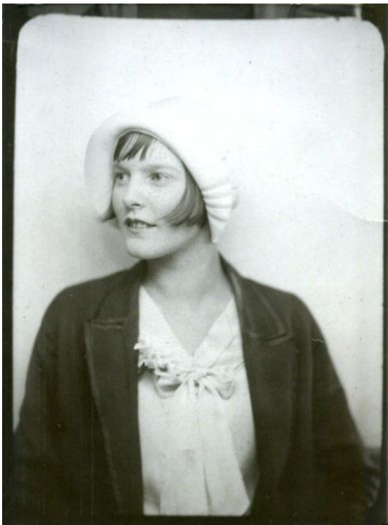
Betty Parks -Secretary (age 25 , Assimilated) Level I Worker

MS=44, AG=81, 08=69, DR=75, PR=7, LK=33, HP=18