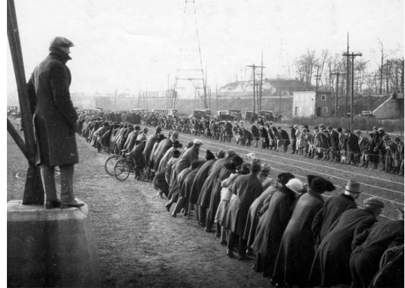
Vickers race track