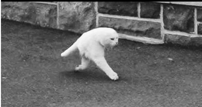
THE LONGER YOU LOOK THE WEIRDER IT GETS

*SPECIAL MOVE* WHEN YOU TAKE AN OPPORTUNITY TO PROVE WHAT YOU'VE LEARNED TO SOMEONE ELSE, THEY RECEIVE A TOKEN.