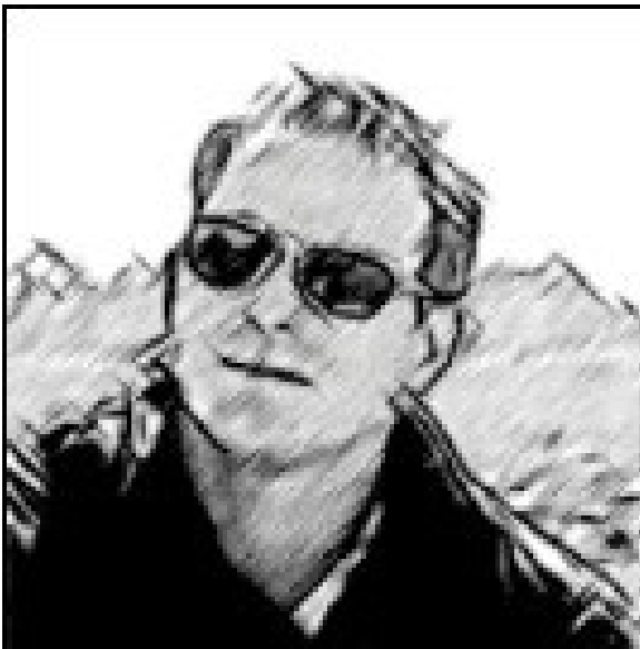
M.I.B. #2 (White)

If the investigators are looking through it at that point in National Geographic's basement, the MIBs (with or without backup, depending) might try to sanction them, or follow them and then arrange for an abduction and interrogation.