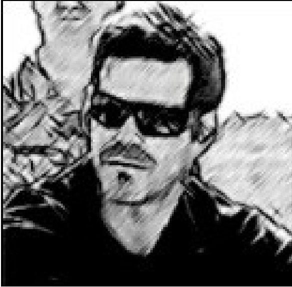
M.I.B. #1 (Black)