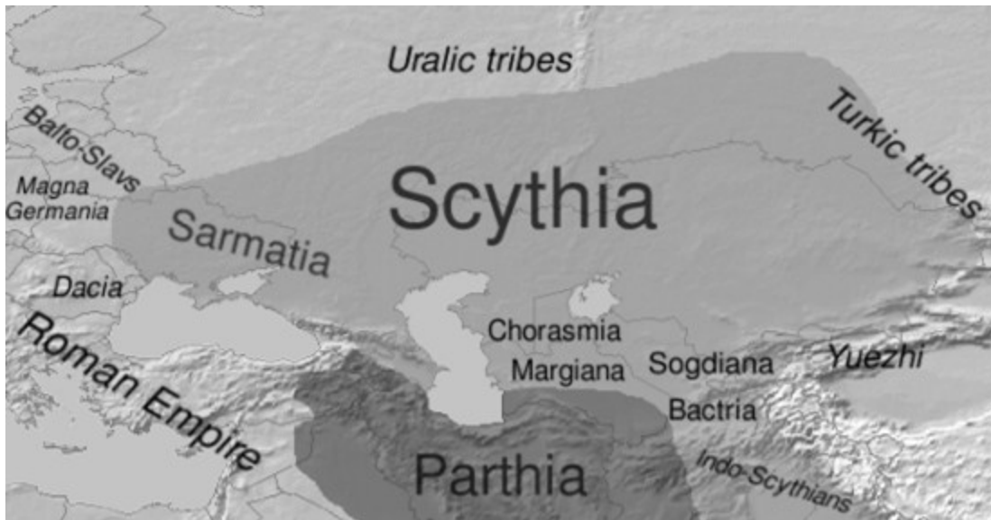
Scythian Empire at its height, circa 400 B.C.

beginning of the destruction of the Scythian empire. Philip of Macedon defeated the Scythian king, Ateas, at the battle of Dobruja in 339 B.C., sending the royal court (including Medea) scattering southeast toward the Dnieper. After being scattered again by Alexander the Great, their remnants settled for several centuries (~300 B.C. ~300 A.D.) in the Crimea, with a capital city known as Scythian Neapolis.