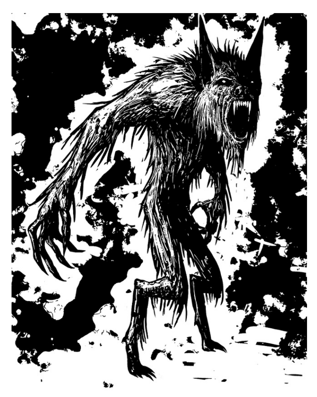
"I hunt, therefor I am. Harvest the land. Taking the fallen lamb."