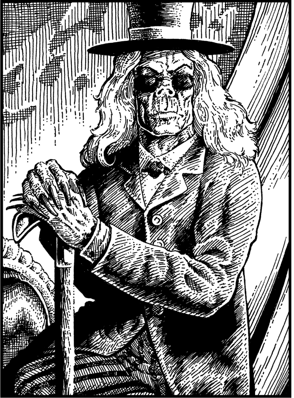
An Ancient Vampire dressed up for a night on the town.