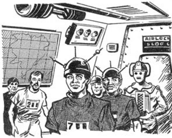
They moved quietly, smoothly, like zombies

Hobson and Benoit stepped up to the three zombie-like men, and Benoit waved a hand in front of their eyes. Hobson turned back to the Doctor. 'I thought you said they were dead?' he said.