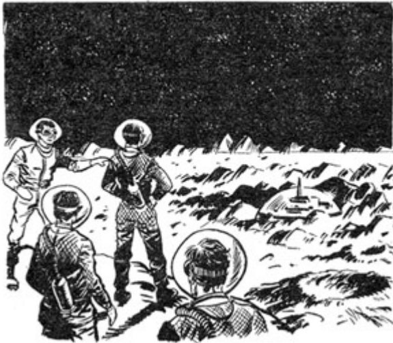
A low plastic dome was apparently imbedded in the lunar surface

Jamie, meanwhile, had found something else to look at: a small white and blue globe high above them in the black, space ‘night’.