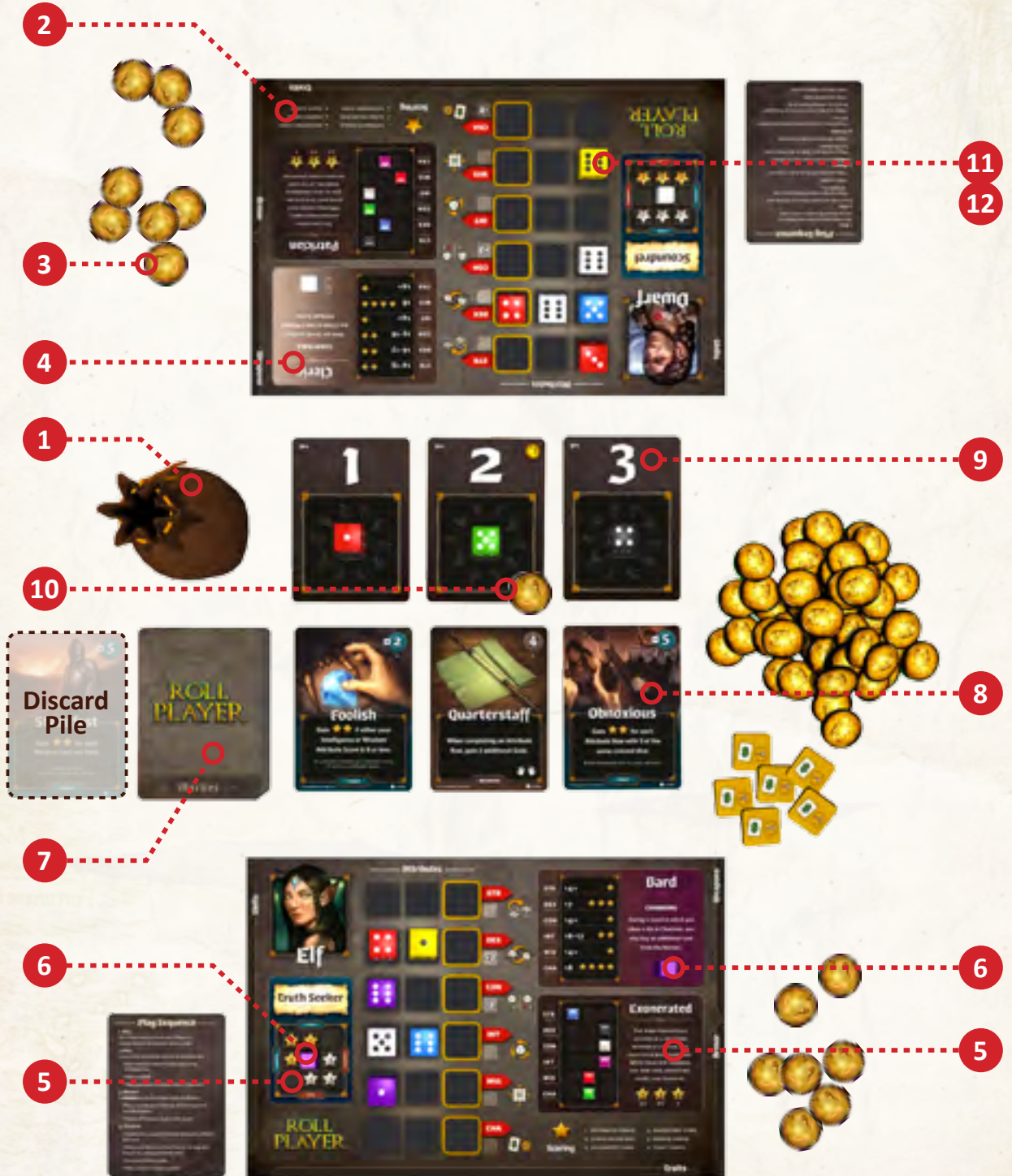
Two-Player Setup Example