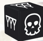
1 Six-sided Die